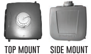
TOP MOUNT SIDE MOUNT